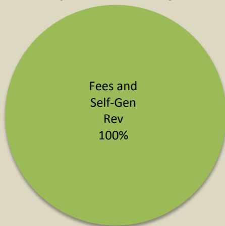
Existing FY 16-17 (as of 9/30/16)