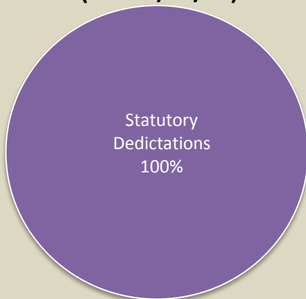
Existing FY 16-17 (as of 9/30/16)