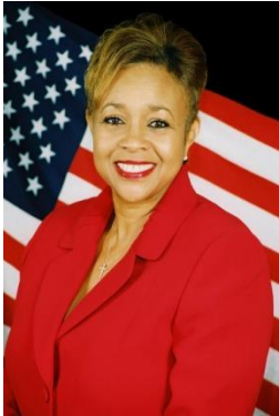
Sen. Yvonne Dorsey Colomb Baton Rouge, District 14