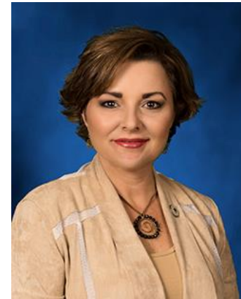
Rep. Malinda White Bogalusa, District 75