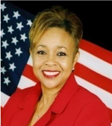
Sen. Yvonne Colomb Baton Rouge, District 14